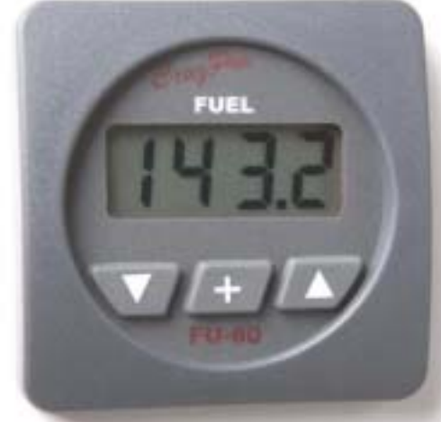
Intelligent Digital Fuel Gauge/w Alarms & Consumption Calculator

key again results in the next set of data being displayed.